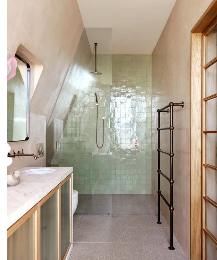
This page, clockwise from top left in the ensuite bathroom Ananke marble from Euro Natural Stone was selected for the benchtop with Italian terrazzo used for the floors. 'Petal' wall light from Studio & Co. Handmade 'Casa' tiles from Onsite clad the shower wall. Sika Design 'Charlottenborg' armchair from Domo in a corner of a bedroom with Serax 'Pawn' side table from Finnish Design Shop. The children's bedroom is enlivened by custom bedheads in Edit 'Vases' fabric. MD House 'Vertex' bedside tables from Fanuli with Jaime Hayon lamps from Cult. Kundalini 'Kushi' suspension light from Radiant Lighting. Tappeti custom rug. Opposite page The main bedroom has a custom bedhead upholstered in Studio Four NYC 'Grove Citron' linen. 'Profile' bedside tables in American oak from Zuster with ceramic lamps from Sarah Nedovic Gaunt.