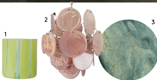
1 Light green and ice blue Murano glass, $145, from Sunnei. 2 Vintage Italian Murano chandelier, approx. $1605, from 1stDibs. 3 'Apple Green' marble, POA, from Signorino.