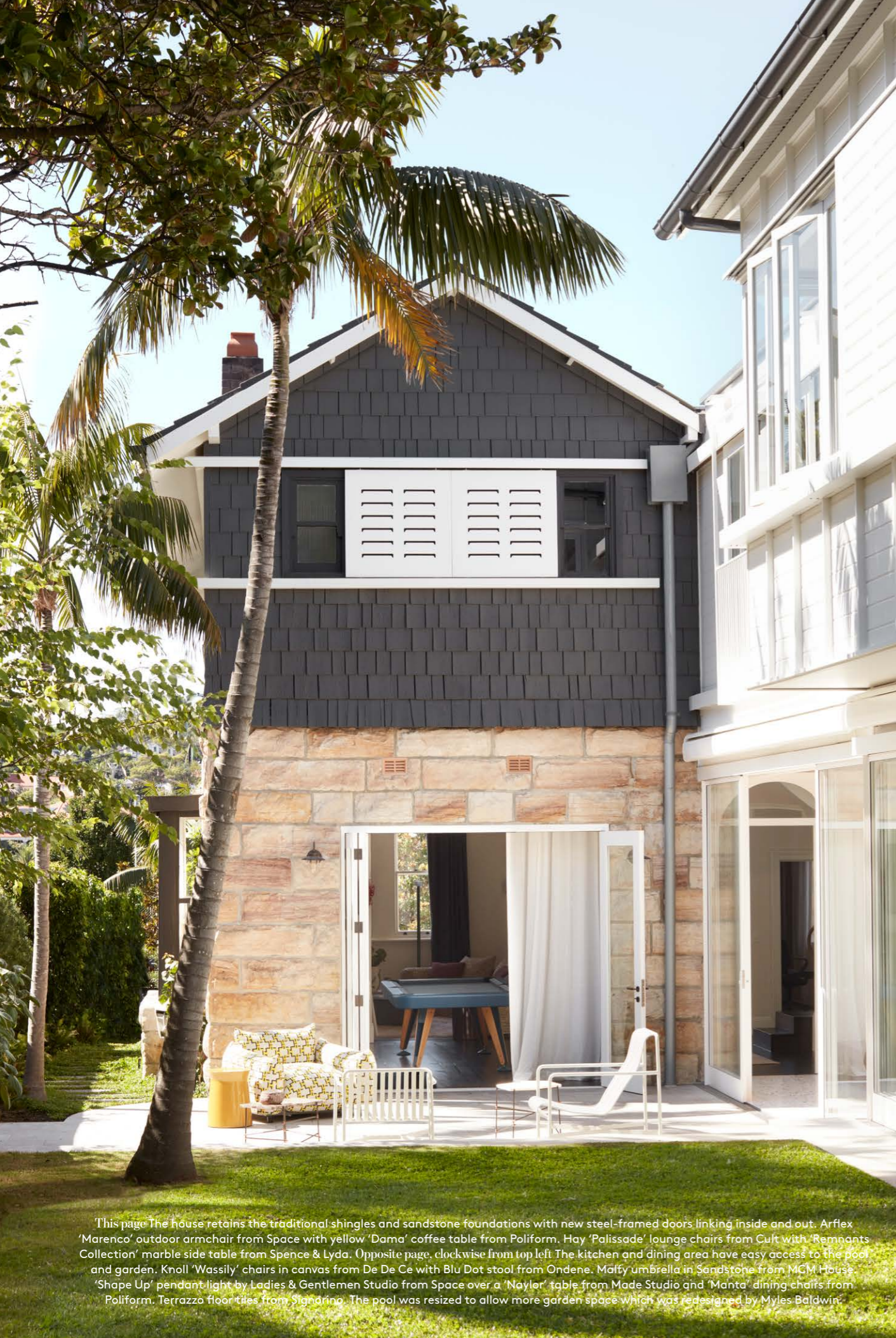
This page The house retains the traditional shingles and sandstone foundations with new steel-framed doors linking inside and out. Arflex 'Marengo', outdoor armchair from Space with yellow 'Dama' coffee table from Poliform. Hay 'Palissade' lounge chairs from Cult with 'Remnants Collection' marble side table from Spence & Lyda. Opposite page, clockwise from top left The kitchen and dining area have easy access to the pool and garden. Knoll 'Wassily' chairs in canvas from De De Ce with Blu Dot stool from Ondene. Malfy umbrella in Sandstone from MCM House. 'Shape Up' pendant light by Ladies & Gentlemen Studio from Space over a 'Naylor' table from Made Studio and 'Manta' dining chairs from Poliform. Terrazzo floor tiles from Sigdrino. The pool was resized to allow more garden space which was redesigned by Myles Baldwin.