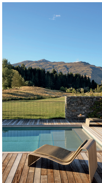
Clockwise from top This home's mastery of colour and texture comes to the fore in the bedrooms; A custom ceramic-tiled coffee table; The poolscape opens to a striking alpine view